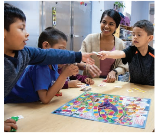
Easterseals' Child Development Services program.